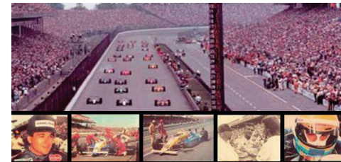
Tero Palmroth was the first Scandinavian ever to compete in Indianapolis 500 in 1988.

1988 Tero becomes the first scandinavian driver in a Indy 500 start up.